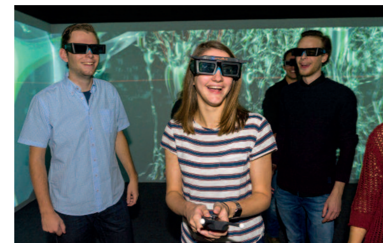
Students experiencing virtual reality in the DAF Technology Lab on campus.

Additionally, no additional earnings threshold applies to EU/EEA students (except to those from Croatia), so you can have a paid job in addition to your studies.